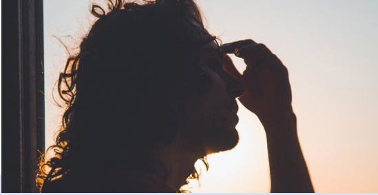
Tips for Managing Stress During the Pandemic