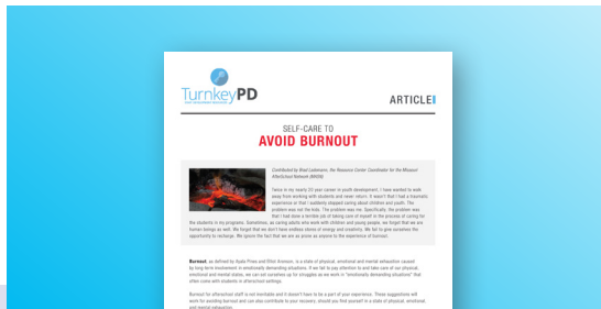
Self-Care to Avoid Burnout - TurnKeyPD