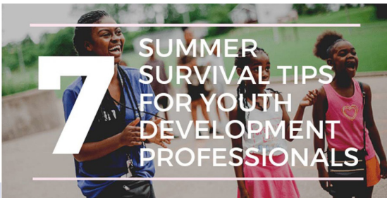
Survival Tips for Youth Development Professionals