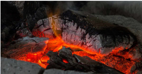
Self-Care Tips to Avoid Burnout