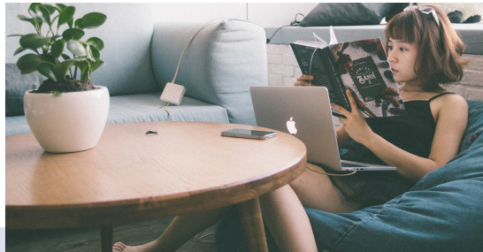
Does Work Life Balance Exist?