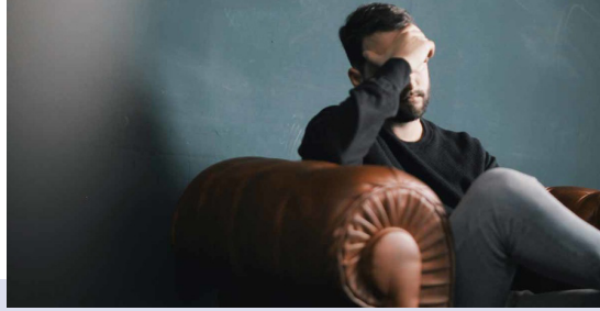
Managing Stress Proven to be a Key to Success